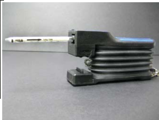
Figure 2. Pull tube in sampler pump.

Diffusion tubes (also known as Passive tubes or Dosimeter tubes) offer an even less expensive colorimetric option to monitor ammonia gas in the animal environment since the sampler pump is not needed. Another advantage is that diffusion tubes provide an average ammonia level over a period of hours rather than the spot check of the pull tube. One end of the diffusion tube is broken off, time of deployment written on the tube, and then the tube is positioned in the environment of interest. As the name implies, ambient air slowly diffuses into the tube's