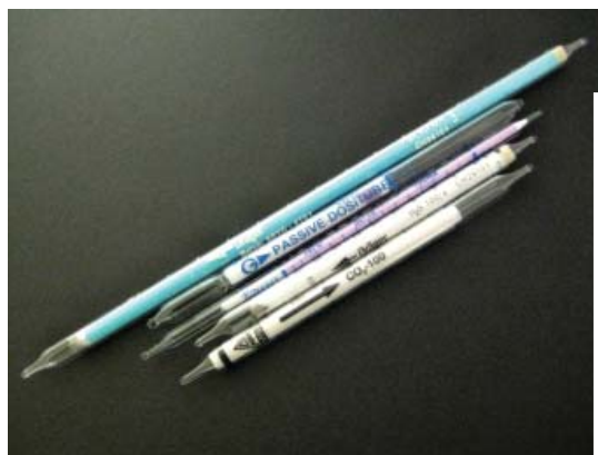
Figure 1. Colorimetric tubes.

The lowest cost ammonia instrumentation that offers reasonable accuracy (about 20% of reading) is an instrument group called Colorimetric Tube (also known as Detector Tube). The pen-sized glass tube changes color along its length after exposure to ammonia gas as the contents of the tube react with the air contaminants (Figure 1). The length of the color change in the detector tube indicates the concentration of gas in the sample, similar to reading a glass thermometer. The ammonia concentration is determined at a location where the tube color has stopped changing with the concentration read from the scale printed on the glass tube. There are two main types of colorimetric tubes: Pull tubes and Diffusion tubes .